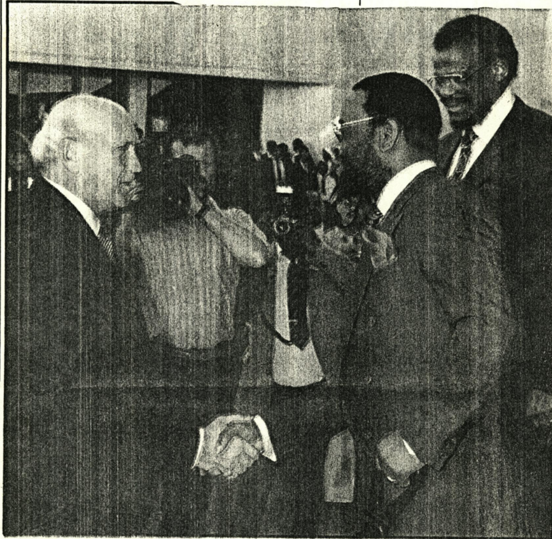
President de Klerk received a friendly welcome from thousands of Zulus at Ulundi yesterday in spite of the presence of placard-holders demonstrating against the exclusion of KwaZulu and the Zulu King from Codesa. King Goodwill Zwelithini is shown shaking hands with Mr de Klerk, while Dr Mangosuthu Buthelezi looks on.