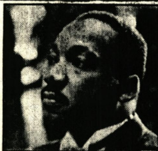
MARTIN LUTHER KING.