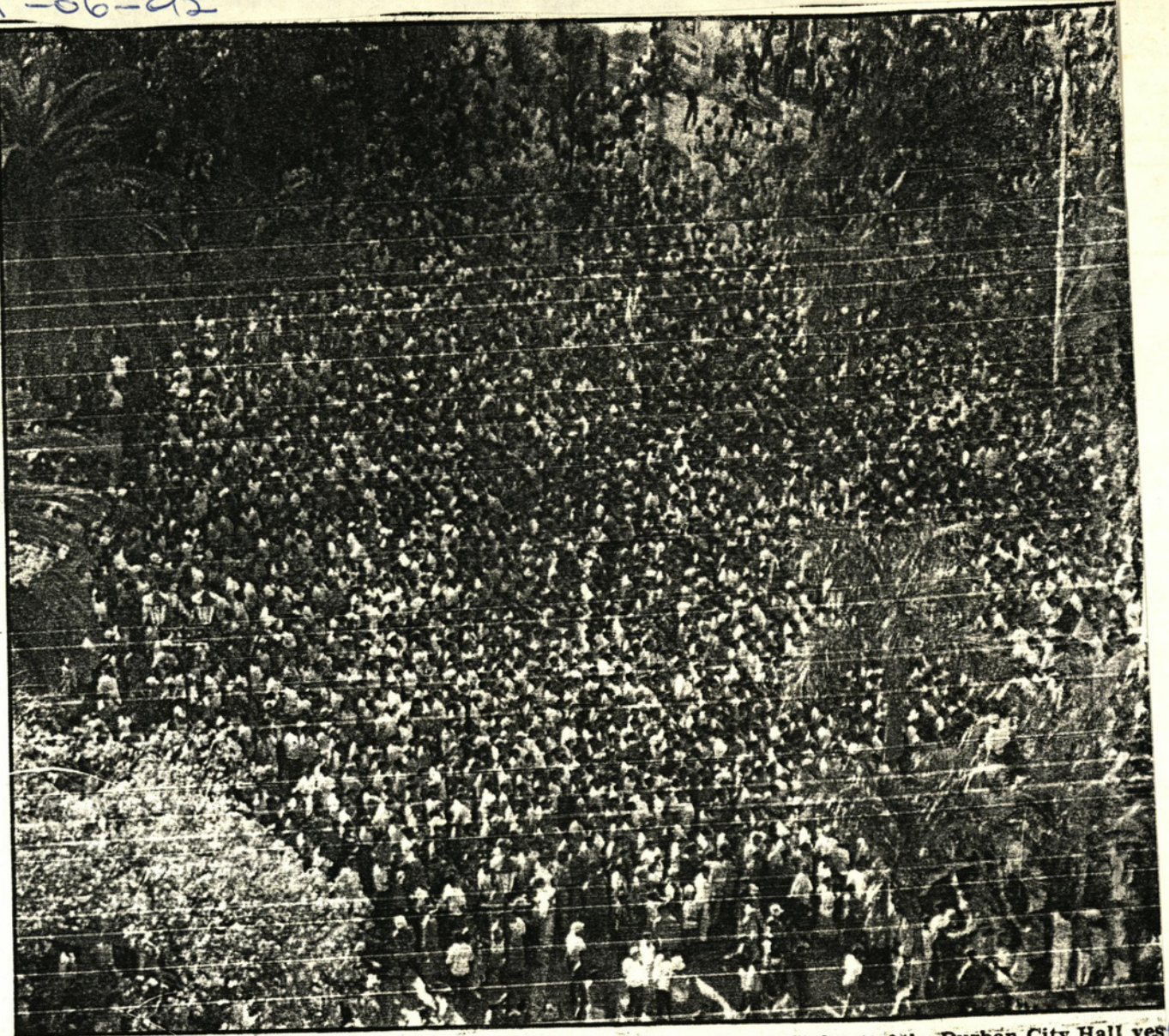
Part of the large crowd, which marched from Currie's Fountain, gathered in front of the Durban City Hall yesterday while representatives of the ANC Youth League handed a memorandum to a senior police officer.

● The Chamber of Mines said more than 98% of the industry's workforce reported for work.