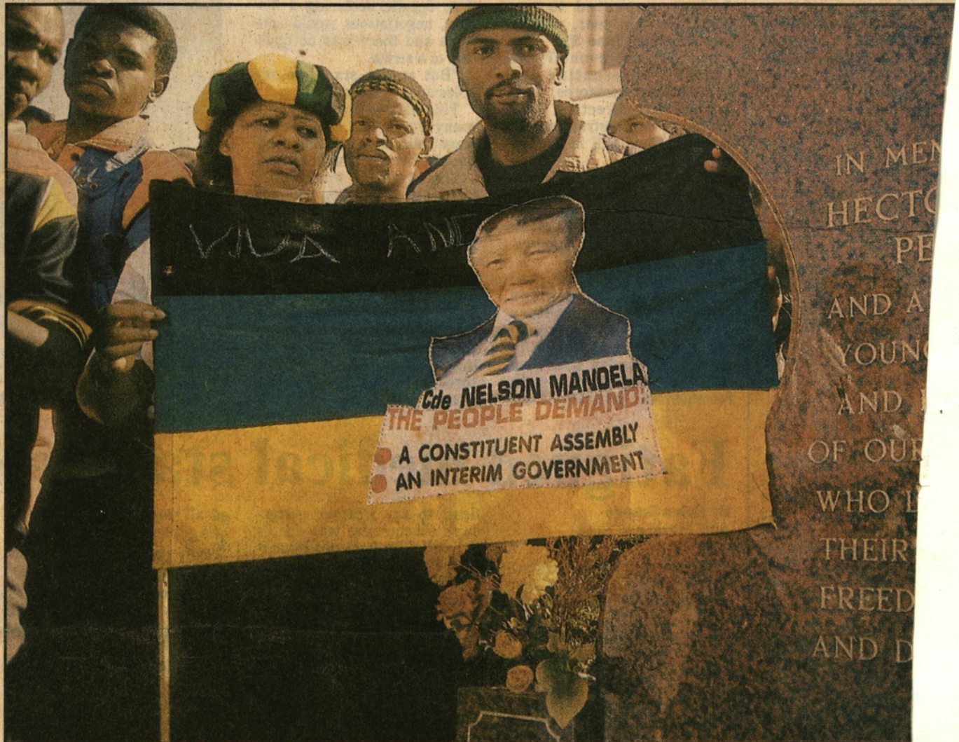
Sixteen years on . . . ANC supporters stand at Soweto's memorial to the first victim of the 1976 uprising.