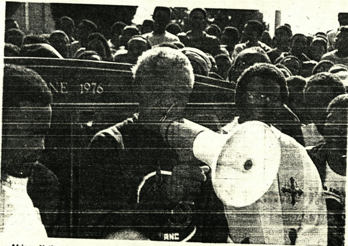
African National Congress president NELSON MANDELA addresses township residents in Soweto yesterday after unveiling a memorial to Hector Peterson and others killed during the student uprising in 1976. — See Page Four.