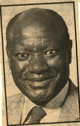
Dr Bernard Chidzero

"Esap (the economic structural adjustment programme) is not going to be abandoned. The programme is not just decided on by government, it was also agreed by the central organs of the ruling party (ZANU-PF). In other words the party in power adopted Esap and all that it implies. We may have debate on the speed with which we are moving, the speed of decontrol-