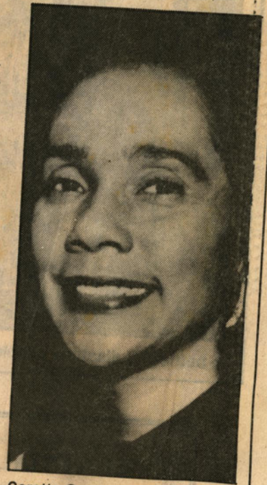
Coretta Scott King . . . support for mass action campaign.

"Martin Luther King was strongly opposed to apartheid, which the SAP has supported with the most vicious tactics imaginable, including murder, torture and a relentless campaign of terror against the non-