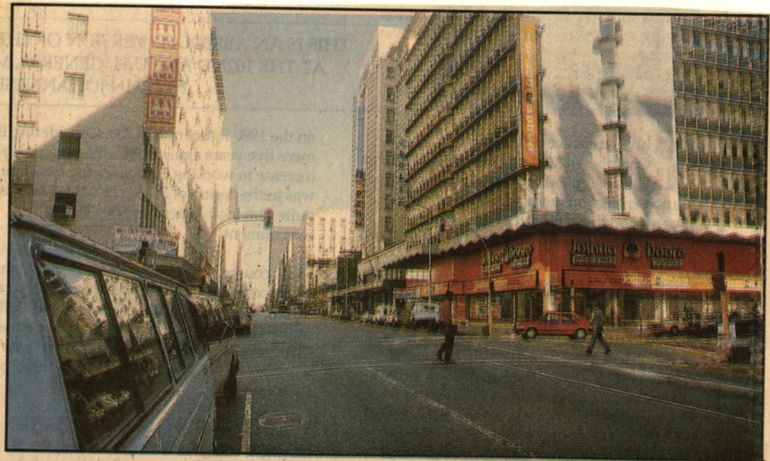
Deserted ... the streets of Johannesburg stood virtually empty as thousands of workers heeded calls to stay away on Soweto Day.