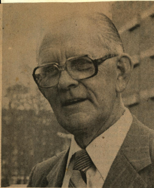
General Van den Bergh ... the formidable head of the Security Police who took charge of intelligence operations.