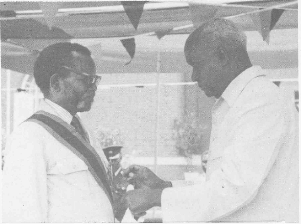
On the occasion of his 70th birthday, President Tambo is awarded the Grand Companion of Freedom (First Division) by President Kaunda of Zambia (above) and the Order of Friendship by Czechoslovakian President Gustav Husak (below)