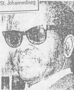
Mr Oliver Tambo

If the ANC is ever to contend seriously for state power in South Africa it will have to do so under the leadership of younger and more vigorous men than Mr Tambo now is.