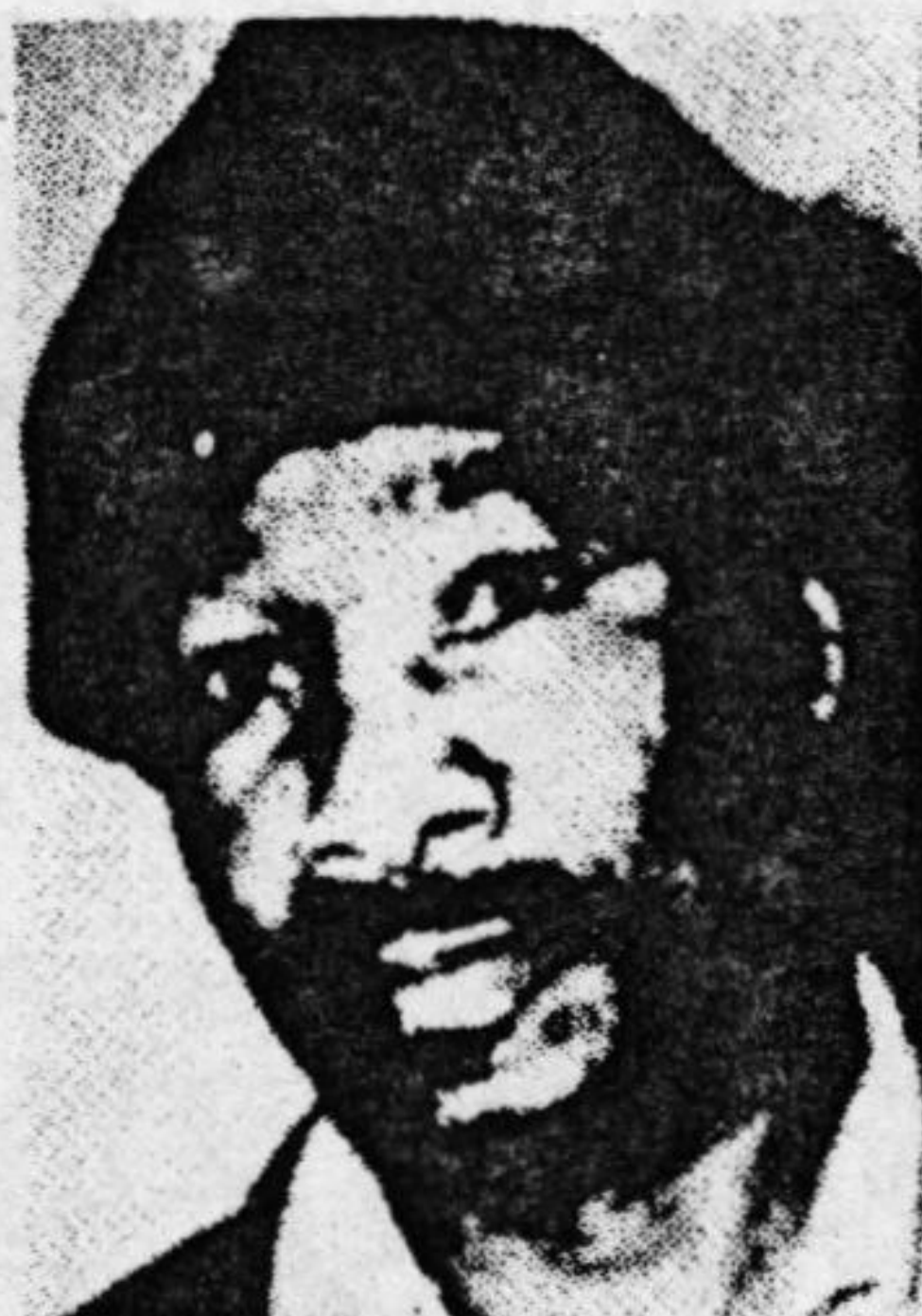
DR. GOVAN MBEKI FUND UNIVERSITY OF AMSTERDAM THE NETHERLANDS