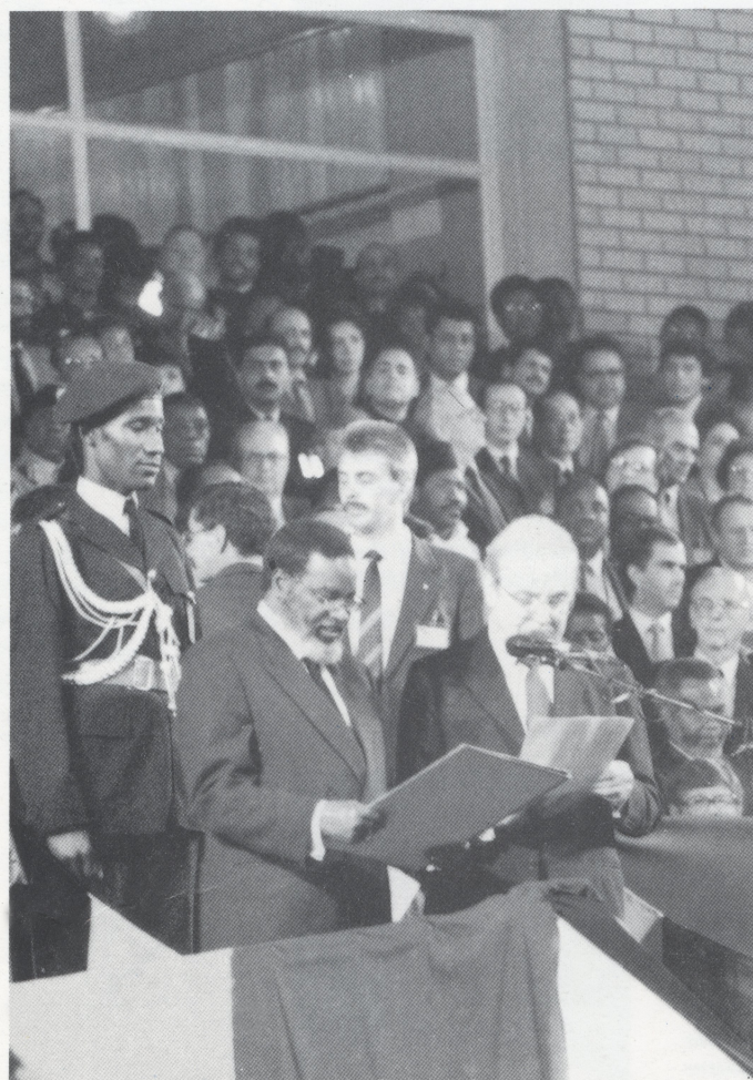
Birth of a Nation: Secretary General of United Nations administering the oath of office to the President of Namibia, 21 March, 1990.