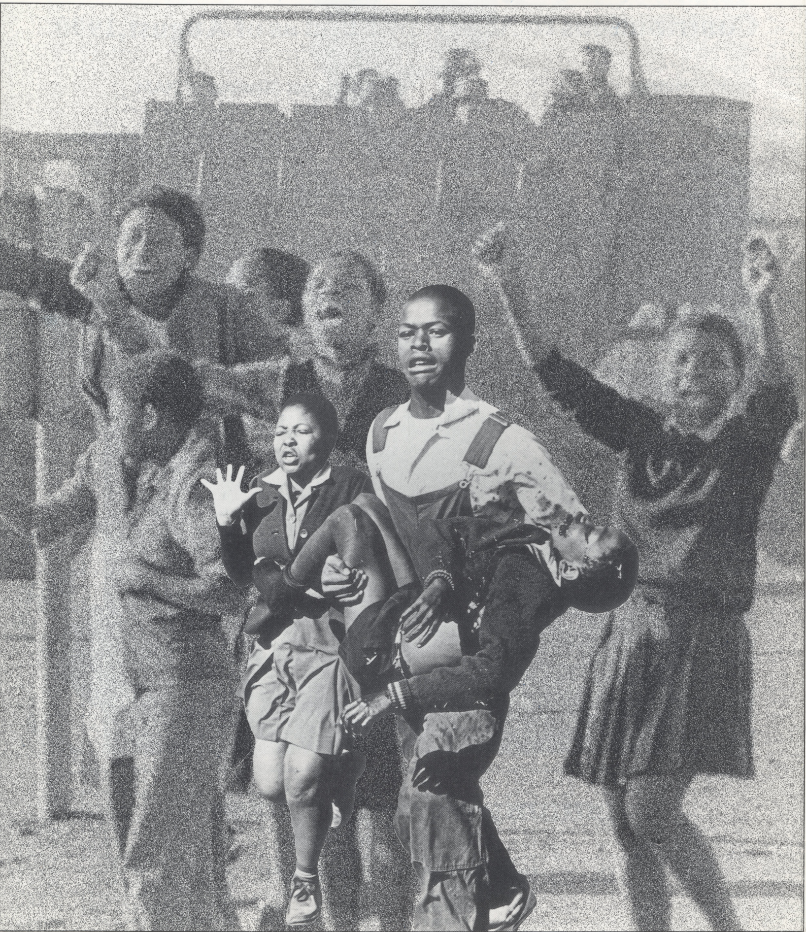
Agony and Triumph