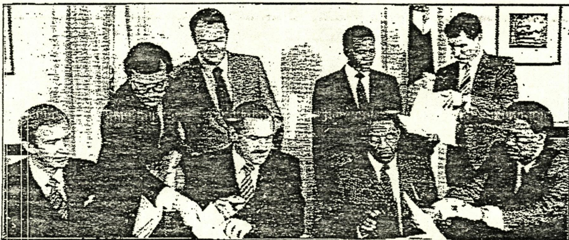
WINNING FRIENDS: (Top) Nelson Mandela and Ciskei leader Oupa Gqozo outside Ciskei State House. (Above) Foreign Affairs minister Pik Botha and Bophuthatswana head Lucas Mangope sign an agreement.