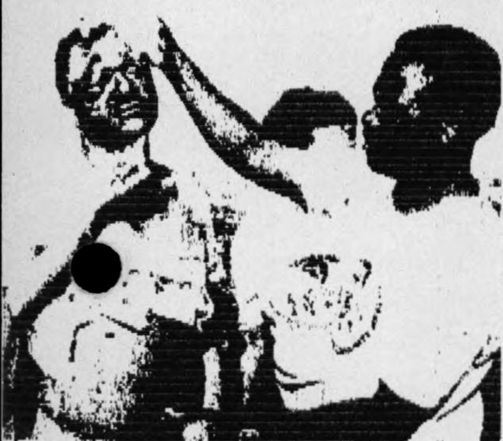
A suspected Inkatha member receives attention after being attacked near Orlando stadium.