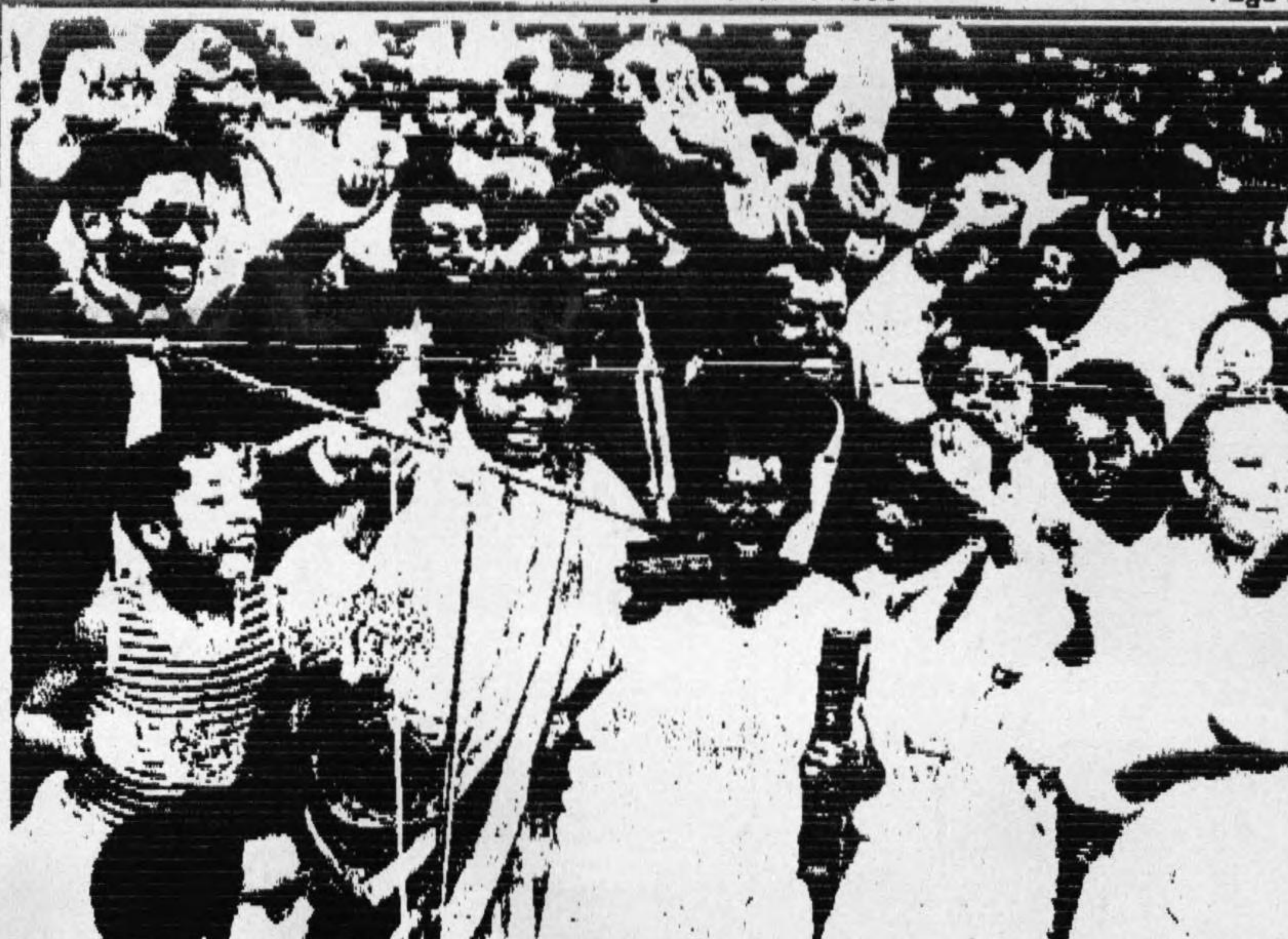
Members of the Soweto-based Regina Mundi Choir were all smiles after qualifying for the national contest in the Old Mutual Choral Competition in Johannesburg yesterday. The finals will be held at the Standard Bank Arena on November 8 and 9.

Mr Jay Naidoo, general secretary of the Cosatu, said the youths must build an organisation that was accountable to the people.