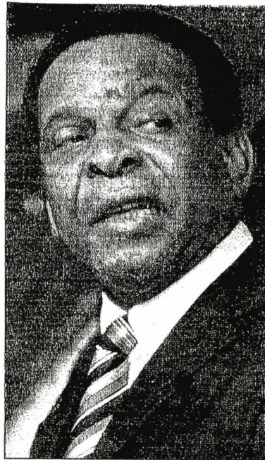
ISILO SamaBandla uGoodwill Zwelithini

UMYALEZO WOKULALA KONYAKA - MNTWANA MANGOSUTHU BUTHELEZI (MP)