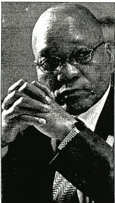
UMENGAMELI wezwe uMnu Jacob Zuma

Siyancoma uma iSilo sikhuthaza ukuzigcina kwezingane zizintombi nto njengoba bekunjalo lapha eSizweni sikaZulu nangaphambi kokufika kweBhayibheli neVangeli.