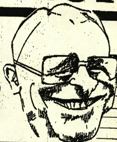
Adriaan Vlok Restricted two key UDF leaders in the week that talks began