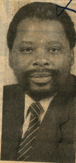
DR OSCAR DHLOMO

Dhlomo said Inkatha had suggested Monday or Friday next week and they had