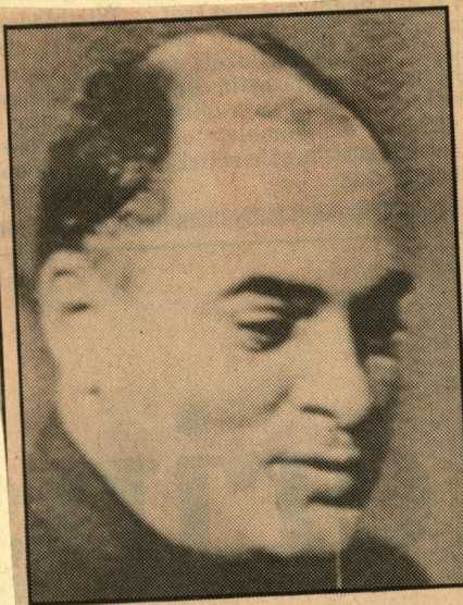
Mr RAJIV GANDHI