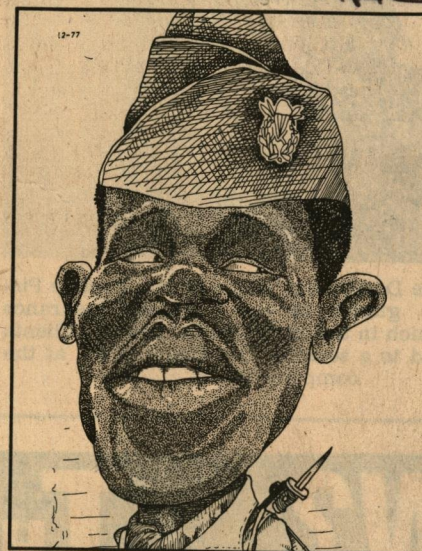
President Mengistu Haile Mariam

The Ethiopian Government has been fighting secessionist guerrillas in Eritrea for 28 years and the rebel Eritrean People's Liberation Front (EPLF) now controls all of northern and eastern Eritrea. Its ally, the Tigray People's Liberation