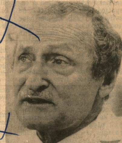
Professor Phillip Tobias ... exploding race myths.

concluded, "the greatest evil of all is the tyranny of prejudice."