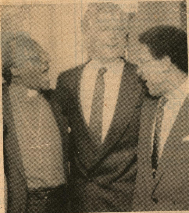
Senator Ted Kennedy jokes with Archbishop Tutu and Dr Boesak when entertained them to dinner this week.

WASHINGTON — The pro-sanctions lobby in the US is not in the least bit concerned about the economic hardship its actions would inflict on the poorest and weakest South Africans.