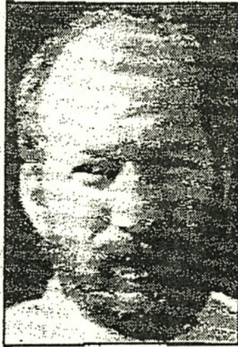
Trevor Manuel ... some state intervention needed.

ANC members show up in the lobbies of the IMF — to "assess what is happening in the economic world."