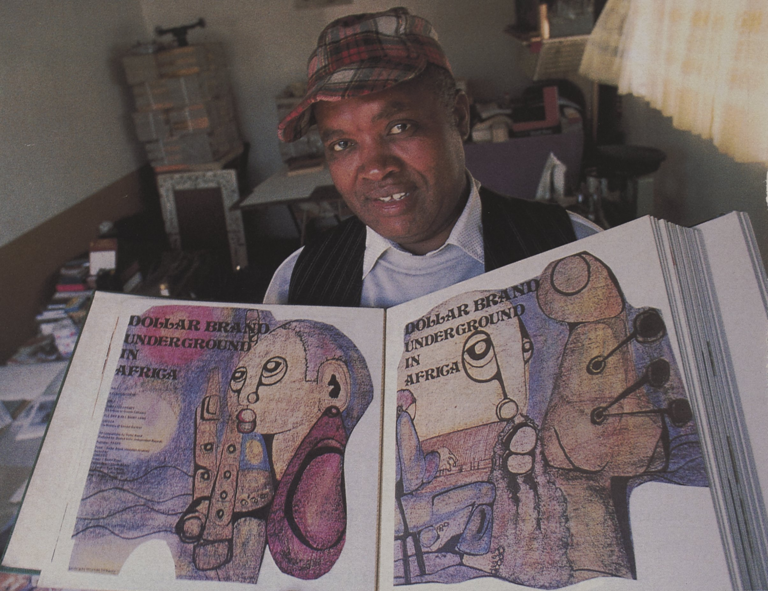
Above: The richly- illustrated record cover for Dollar Brand's record, Underground In Africa .