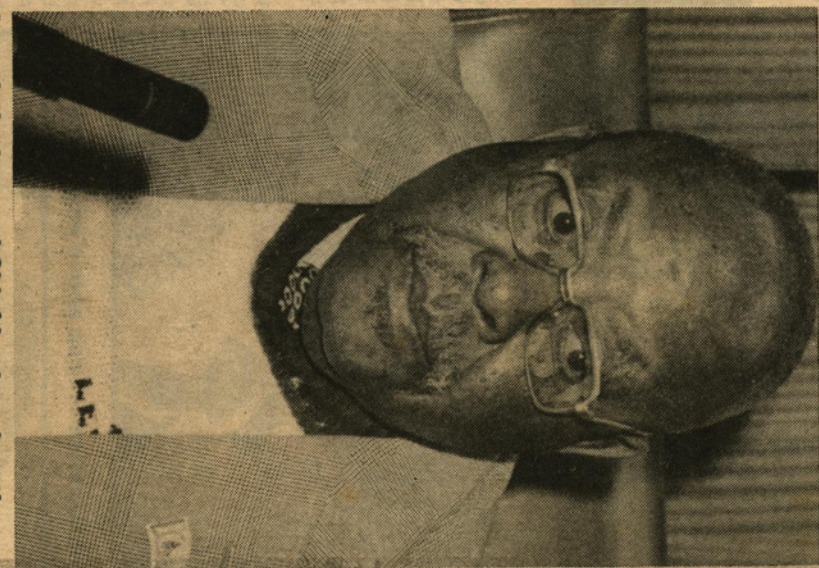
Lesotho's deposed Chief Leabua Jonathan

Conversely, the question is whether the SADF show of strength at Mambatho will serve as a warning to coup-aspirant armies in other homelands and neighbouring states.