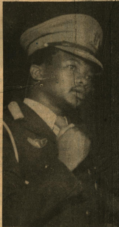
Transkei's Gen Bantu Holomisa

IT started in Lesotho, and eyebrows were raised.