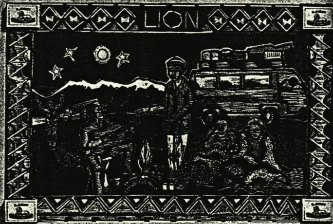
• An opportunity to make a name. Send in your drawing depicting Lion Match and Friendship and win big cash prizes.

The theme is simple — LION MATCH AND FRIENDSHIP. All you have to do to become the Lion Match Artist of 1991 is use your vision to create a picture