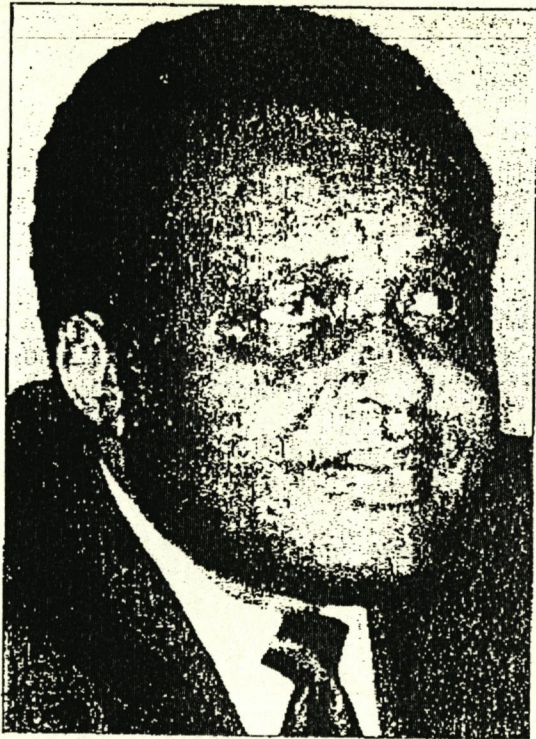
Joe Modise . . . officers were taught to view the top MK commander as a bloodthirsty revolutionary.