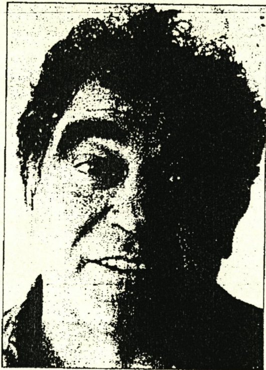
Ronnie Kasrils . . . MK's intelligence chief was regarded as the devil incarnate.