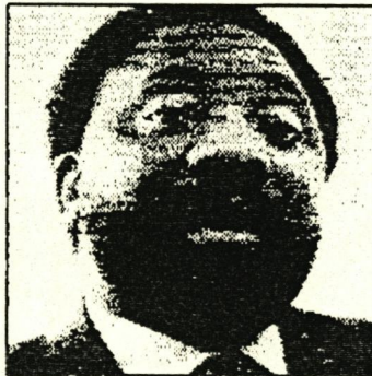
Cyril Ramaphosa ... imbalance of ownership.

He described measures to redress the legacy of forced removals as a fundamental point of departure. "Effective measures to ensure that landless people gain access to land on