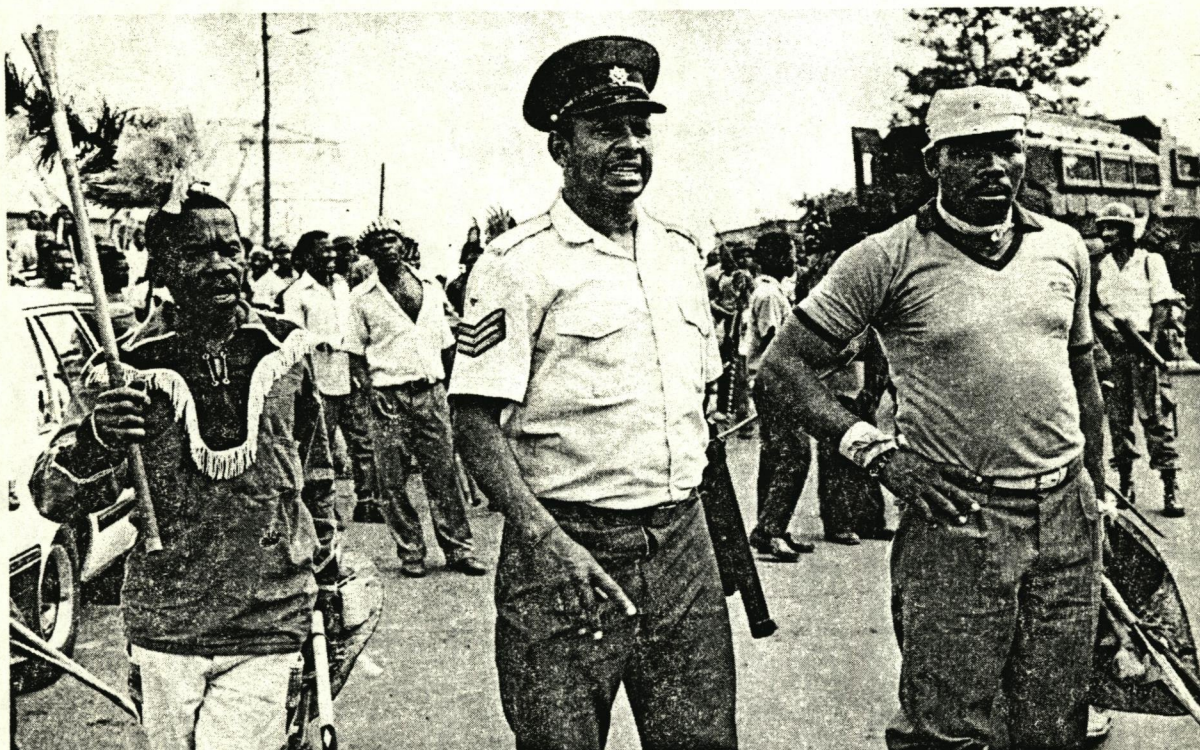
South African police persuade Inkatha supporters to withdraw after a clash with the UDF.

Around the Continent: Burkina Faso • Niger • Western Sahara In Focus: Ethiopia Reference Books