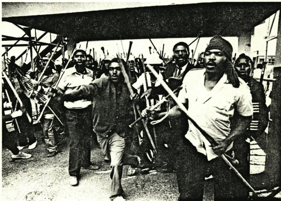
Inkatha warriors at a Soweto Prayer meeting in 1986.

The round of violence started in May when Cosatu's offices in Johannesburg were destroyed by a bomb blast that experts say could only have been the work of experienced sa-