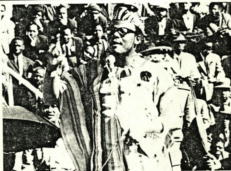
Chief Buthelezi: Negotiating for power