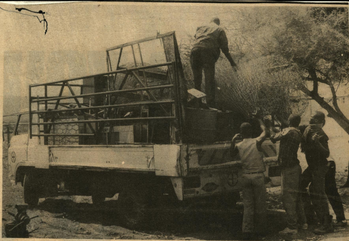
MOUTSE people being moved to a new area: the Group Areas Act has often been used to move people like goods from one place to another to give white developers access to their land.

The research found that though attempts to impose residential segregation started soon after Jan van Riebeeck and the early settlers arrived in the country, the Group Areas Act was enacted in 1950 and described by the then Prime Minister, Dr D F Malan, as the