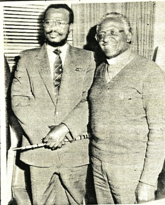
UMONGAMELI weNkatha nonguNdunankulu waKwaZulu, uDr. Mangosuthu Buthelezi, no-Archbishop Desmond Tutu, umholi webandla lamaSheshi, besezingxoxweni zokubonisana eThekwini muva nje.