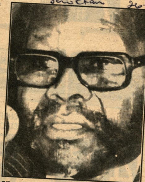
Oliver Tambo ... built the ANC in exile.

Threats by Government agents, ill-health and a nomadic lifestyle fraught with danger failed to douse his determination to forge the African National Congress into a major political force, reports Sapa.