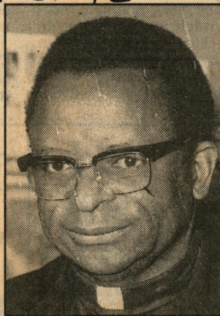
Bishop Abel Muzorewa... no amount of government money and influence could win him many seats.

But lessons can be learned. No amount of South African Government (and therefore people's) money could get any significant number of Ovambos to vote for the DTA. And no amount of Rhodesian Government influence and money could get Abel Muzorewa many seats. Similarly, in the South African elections after the constitution (if it allows democratic elections) no amount of funding for Inkatha will make anyone but a Zulu