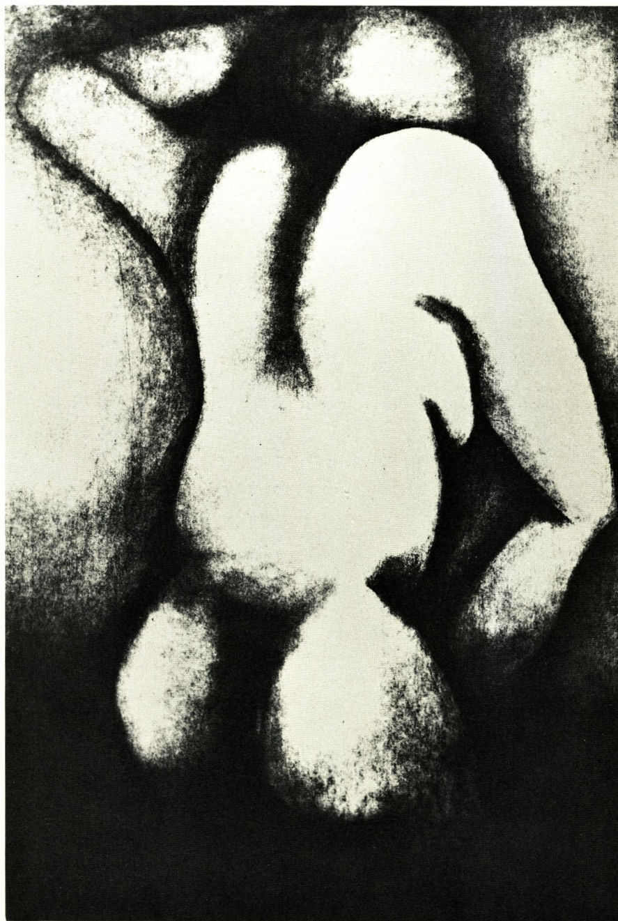
Nude by David Mbele: chalk

gallery is public and open to all races, and is run on an entirely non-profitable basis. The only benefit to the gallery is African art.