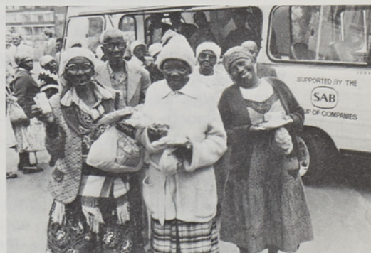
Sixty Soweto pensioners who attended the handing over of the kitchen unit, were the first to be served refreshments from the unit

"Paballoya Batsofo" which means "Serving our Senior Citizens", was