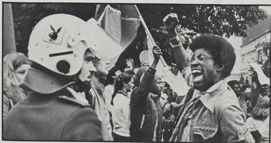
Left: Little came of the direly predicted demonstrations against Mr Botha. There were about 40 rather unenthusiastic demos in Berne, Switzerland, an estimated 14 500 in London, who ranged from punks to supporters of the PLO and opponents of the Cruise missile, and a rather more active crowd in Bonn, where this young man is seen making his point