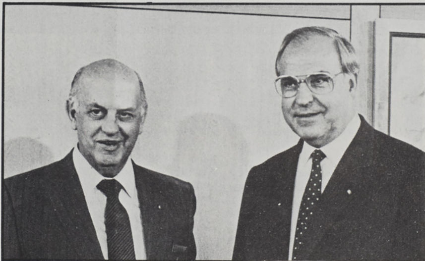
Mr Botha and the Chancellor of the Federal Republic of Germany, Dr Helmut Kohl