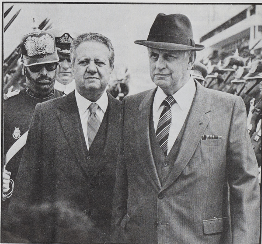
Mr Botha was welcomed to Lisbon by the Portuguese Prime Minister, Dr Mario Soares, with whom he is inspecting a guard of honour. He invited Dr Soares to visit South Africa and the invitation was accepted, although no date has been set

It was under his leadership that the historic Accord of Nkomati, a non-aggression pact with neighbouring Mozambique, was signed in March 1984.