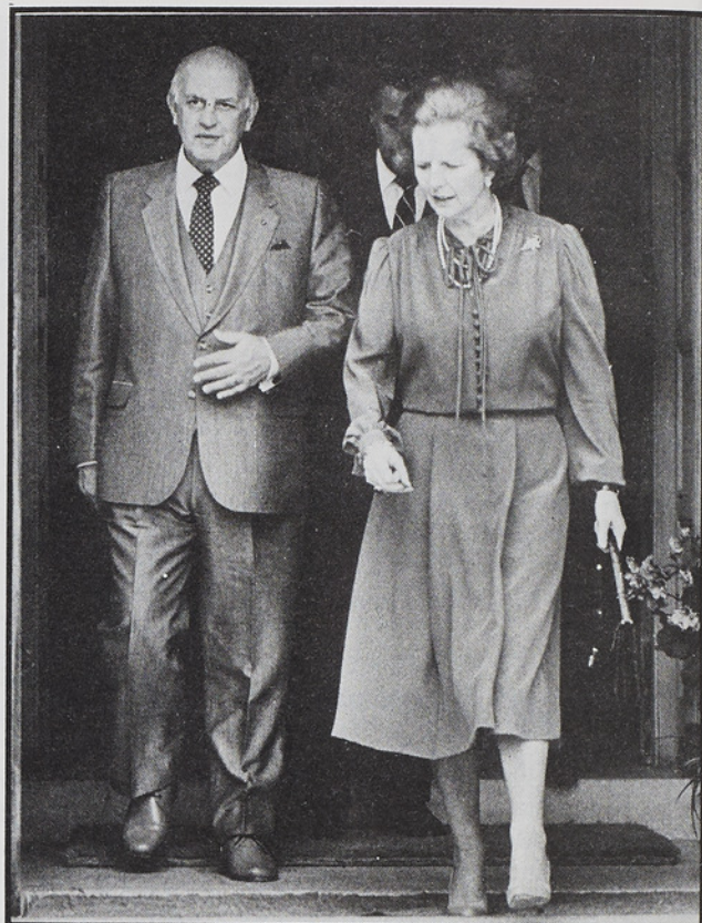
The first time in 23 years that the prime ministers of South Africa and Britain have held talks. Mr Botha flew from Heathrow Airport, London, by helicopter, to Mrs Margaret Thatcher's country residence, Chequers