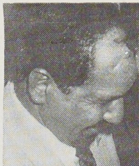
Pres M. Abdel-Aziz