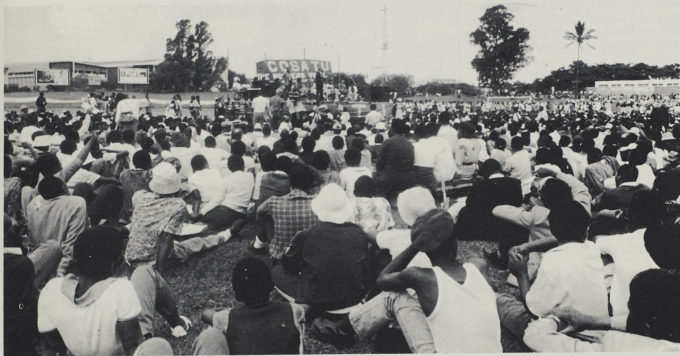
The COSATU rally at Curries Fountain in Durban on May 1 — the same day as the UWUSA launch. It was attended by about 7 000 people.

"However, we have now been approached by workers to find out how we expect them to behave when some unions are now spending their time denigrating Inkatha."