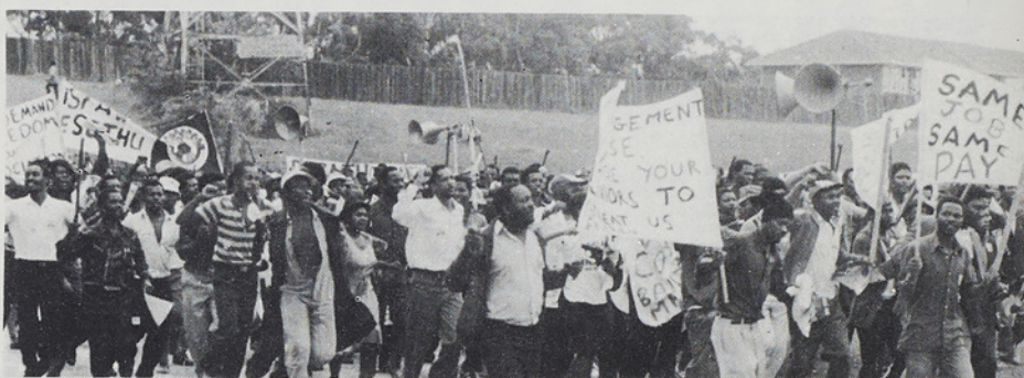
COSATU supporters at Curries Fountain on May 1. Traditionally Zulu men carry sticks, as shown here. Anti-Inkatha propagandists try to allege that only Chief Buthelezi's supporters carry them.

Chief Buthelezi has stood by his people and has refused all attempts by the Government to force the Zulu nation to take "independence" for KwaZulu. In founding Inkatha — with a current membership of 1.3 million — he has forged the largest black political movement in the history of the country. It is a national organisation and does not distinguish between one black and another in terms of their