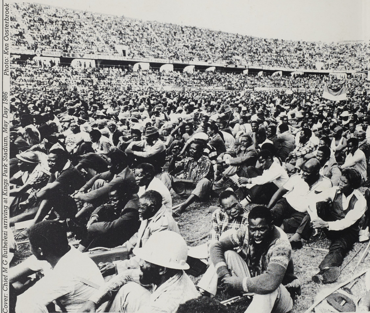
Cover: Chief M G Buthelezi arriving at Kings Park Stadium, May Day 1986