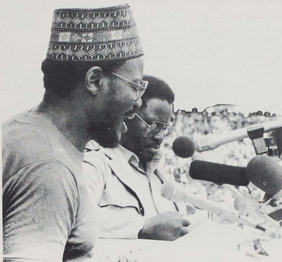
CHIEF M G BUTHELEZI Kings Park, May 1

I n his inauguration address at UWUSA's launch, Chief M G Buthelezi asked the 80 000 present to stand up if they opposed disinvestment and sanctions. Everybody stood up.