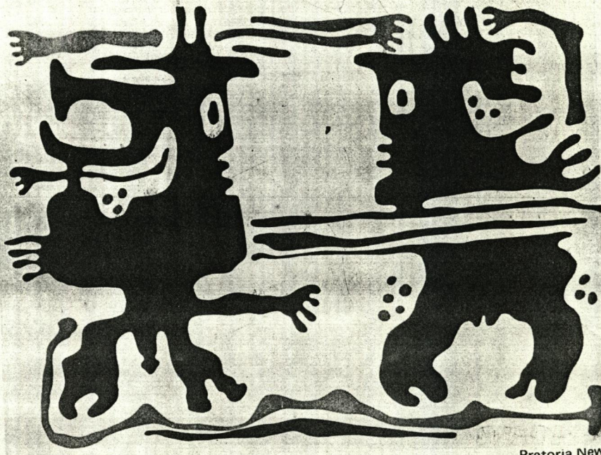
Pretoria News A typical woodcut by Wopko Jensma, whose exhibition of graphics is currently on view in Pretoria. Mr Jensma's works bear the stamp of his African travels

The unit will have a three-fold task — to instruct lecturers in the best use of the apparatus; to maintain the instruments; and to conduct investigations into the efficacy of the different