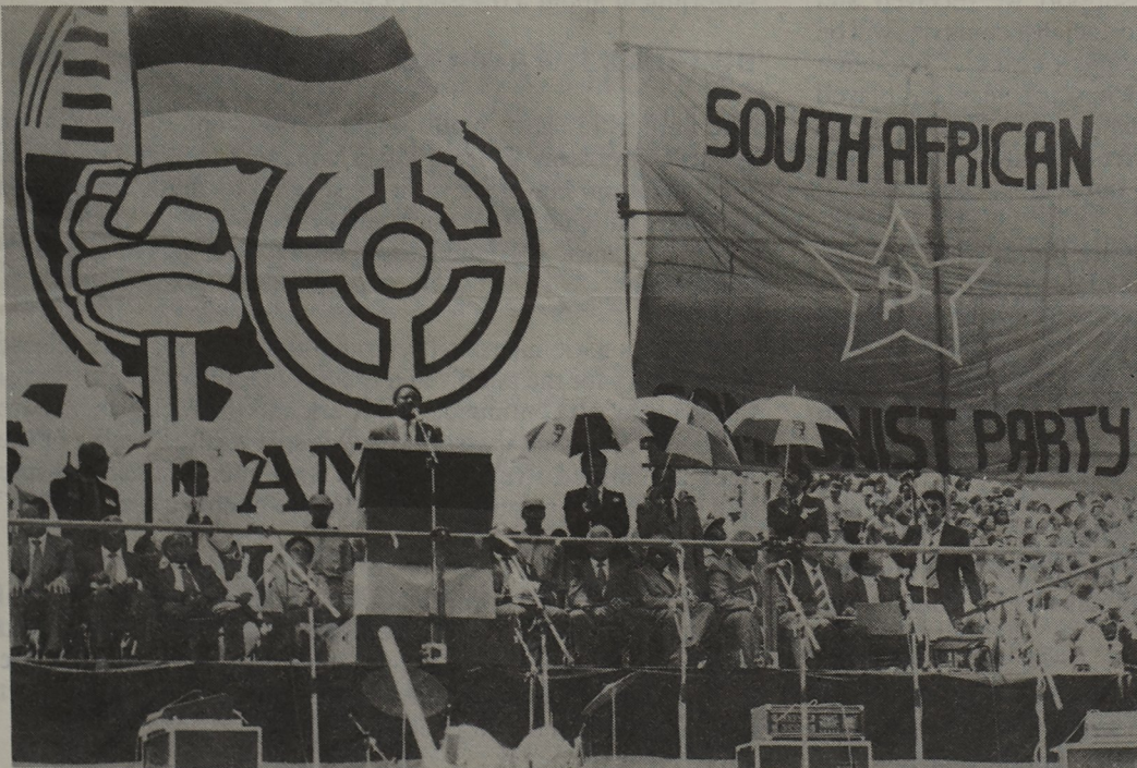
A huge Red Communist flag was given a prominent position at the rally to welcome home released ANC security prisoners.

Speaking on SATV on Oct 29, Dr Allan Boesak skated around a question on the Red flag. He refused to condemn its use although he said he would never walk under it. However he has never stopped any of the many marches in which he has participated to have it removed.