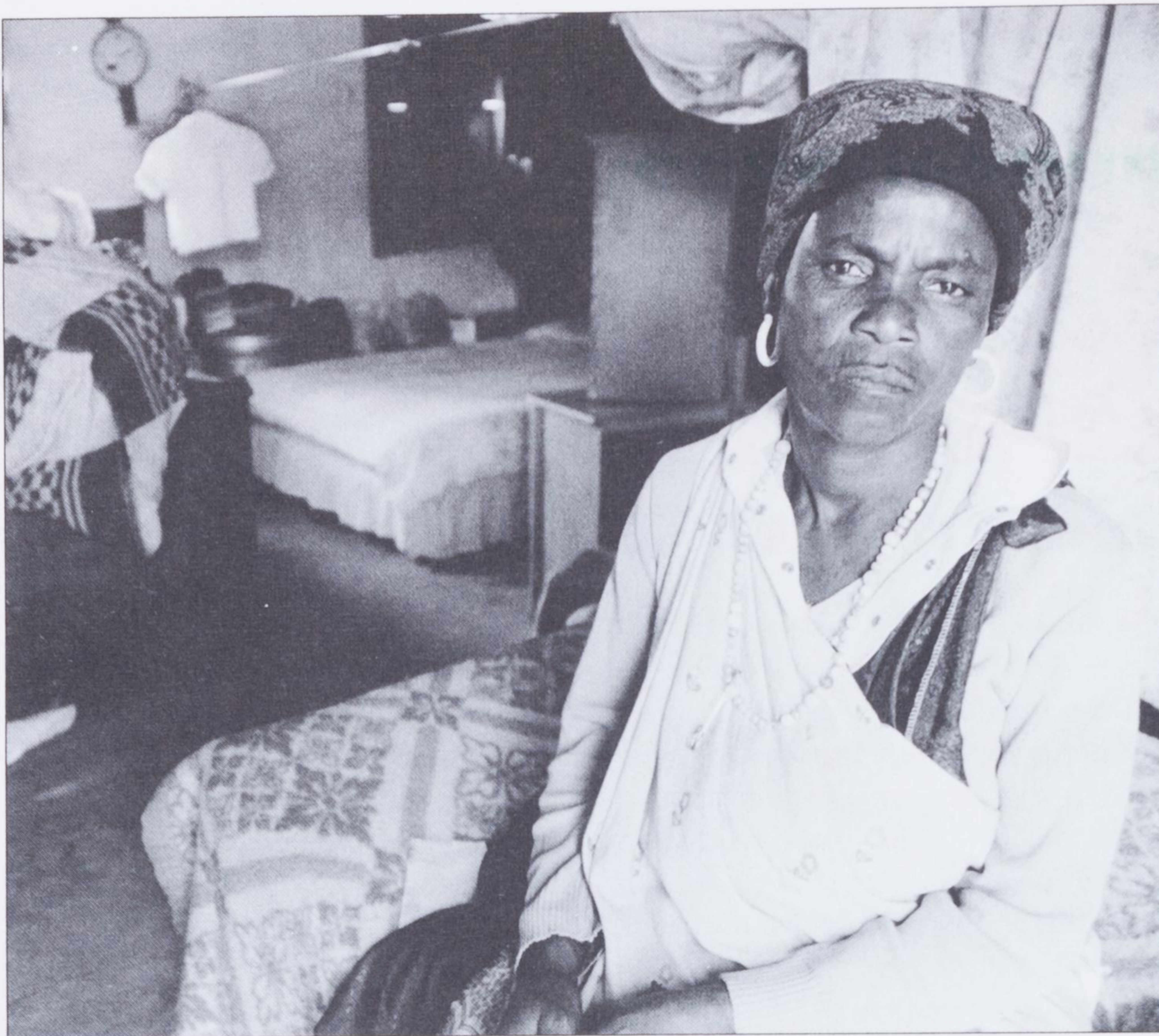
Alexandria township resident displaced by an Inkatha attack.