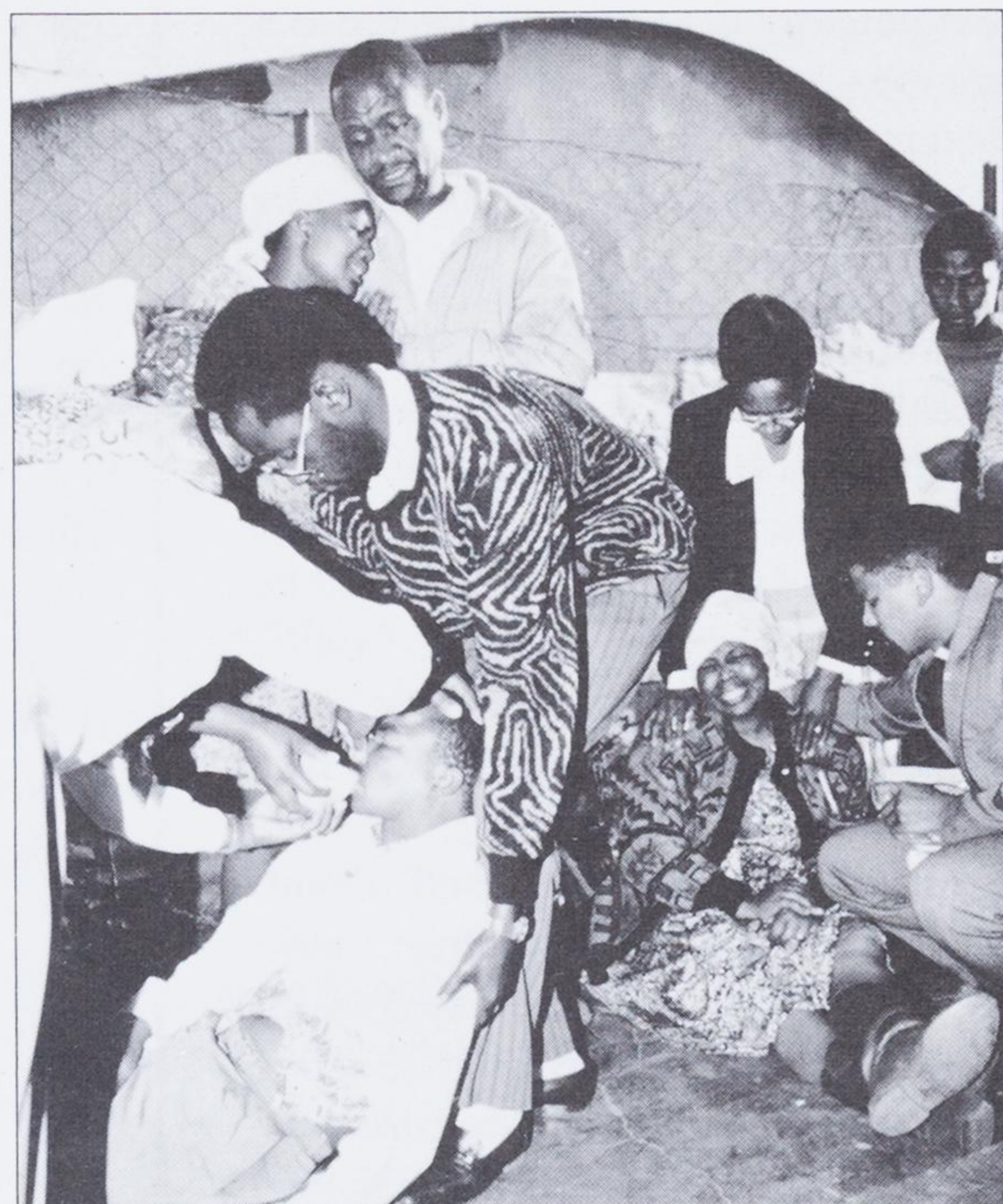
South African Council of Churches delegation comforts victims of the Boipatong massacre.

the African National Congress initiated a large-scale mass action campaign of civil disobedience. It also demanded significant international involvement in monitoring the process. The United Nations Security Council agreed only to the limited step of sending Special Envoy Cyrus Vance.