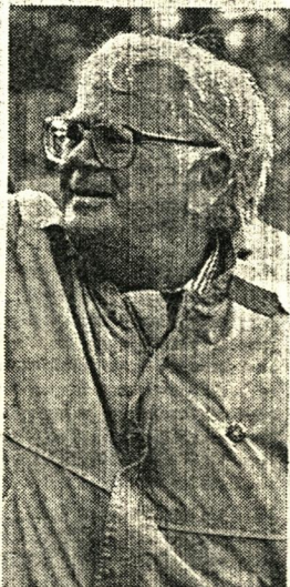
Mr JOE SLOVO ... bone marrow cancer.