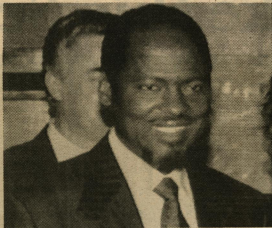
President JOAQUIM CHISSANO ... "not fair" to have his face on banknotes.