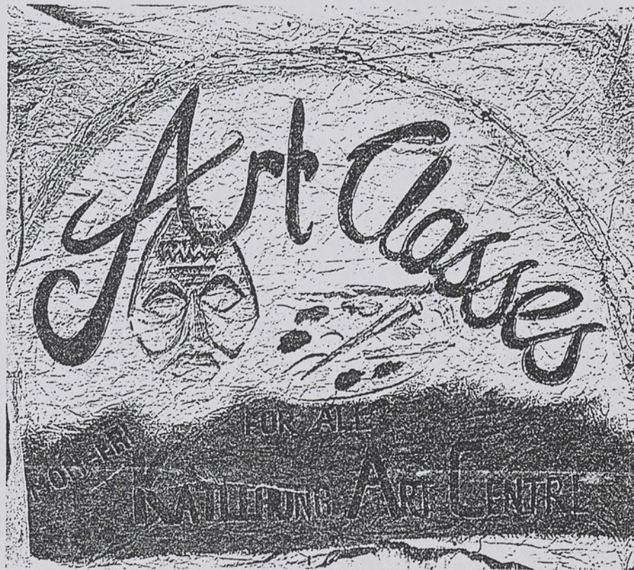
Above: Hand-painted signs invite the whole community to join in the activities. Above, left: Even the walls carry Katlehong's message of art.

design and knitting, to sculpture, painting, metal work, music and drama (a firm favourite with the township kids), it is no exaggeration to say that Katlehong Art Centre is for all. ❖