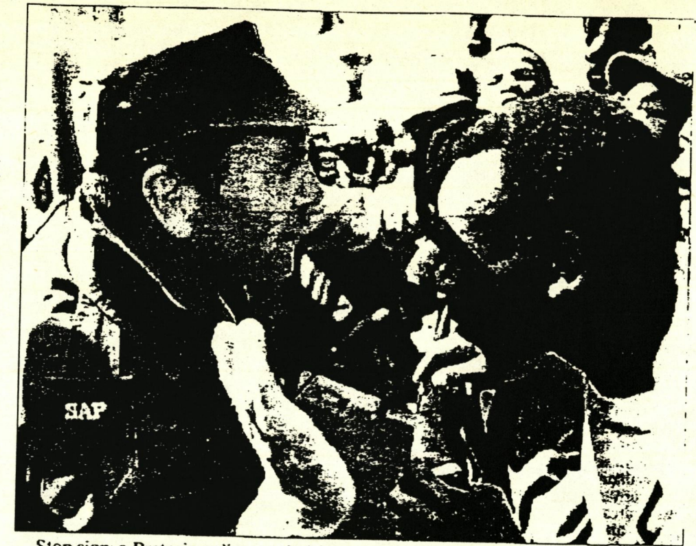
Stop sign: a Pretoria policeman halting marchers outside government buildings

According to yesterday's Sowetan , the newspaper most read by blacks, the govern-