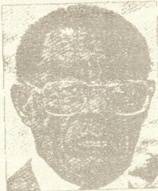
Mr Mangope: chief of warrior regiment at 21

Mr Nelson Mandela, the ANC president, attacked him at every turn, referring to