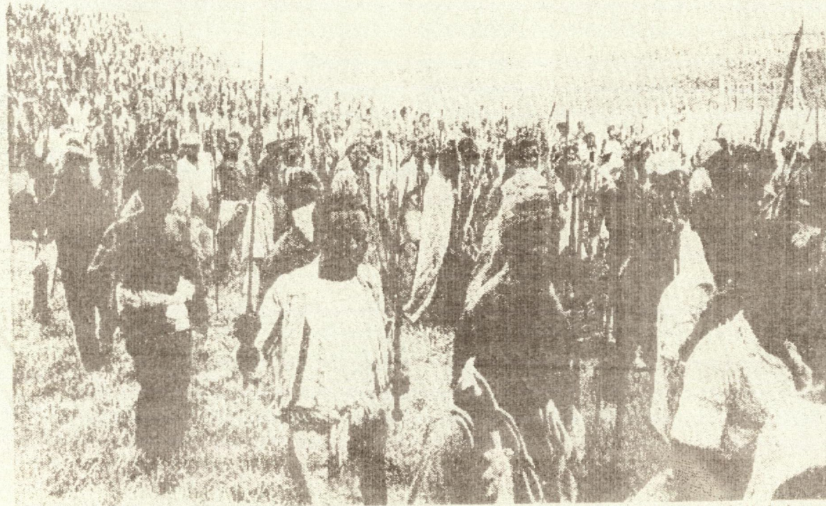
Inkatha Freedom Party supporters armed with spears and shields surround the King Zwelithini Stadium in Umlazi, near Durban, to prevent ANC supporters from entering to hold an election rally yesterday. After a standoff the ANC held the rally in the street outside the stadium.