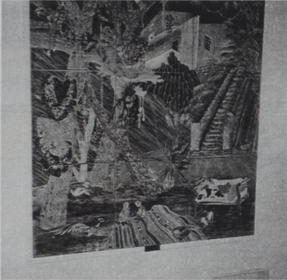
The Paynter Painting