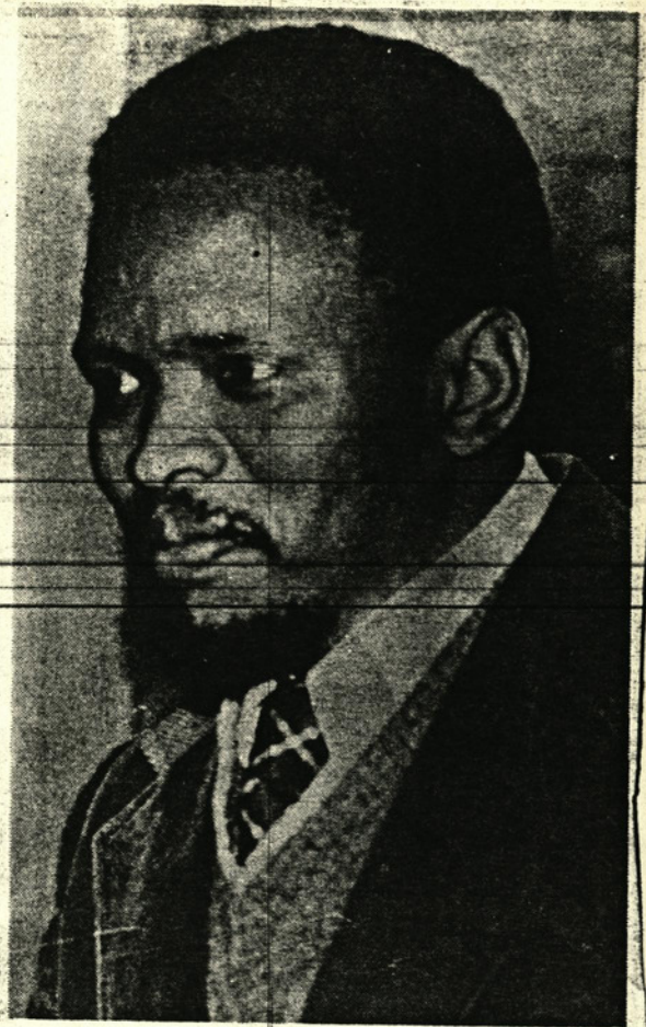
Steve Biko . . . strived for unity