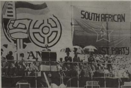
A huge Red Communist flag was given a prominent position at the rally to welcome home released ANC security prisoners.

Speaking on SATV on Oct 29, Dr Allan Boesak skirted around a question on the Red flag. He refused to condemn its use although he said he would never walk under it. However he has never stopped any of the many marches in which he has participated to have it removed.