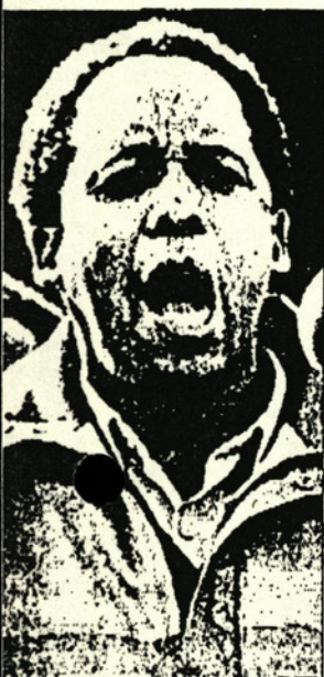
Hani: returned from exile to exalted role