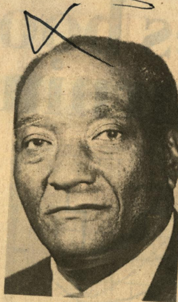
Perkins . . . SA needs interaction.

The process of alienation of South Africa, which started with the institutionalisation of