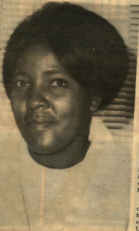
STELLA Sigcau . . . Transkei Prime Minister.

TRANSKEIAN Prime Minister Miss Stella Sigcau has lifted all 12 banning orders imposed by the ousted Matanzima brothers on their opponents.