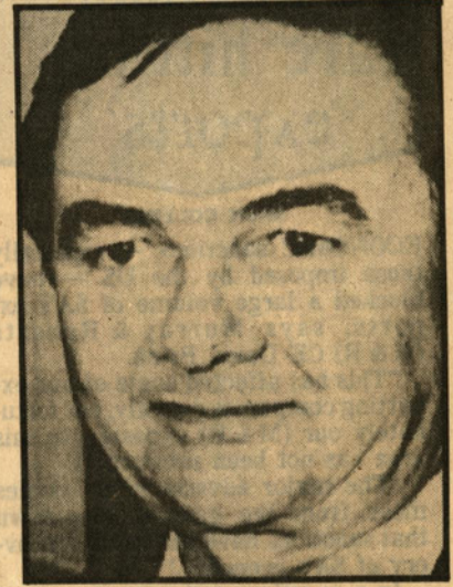
□ BOTHA ... "determined action"

Other labour resolutions, proposed by rural and blue-collar branches, seek a relaxation of industrial council-determined minimum wages for industries bordering the TBCV states, more flexibility in applying minimum wages and a re-evaluation of the restriction on employers in dealing with "unreasonable militant action".