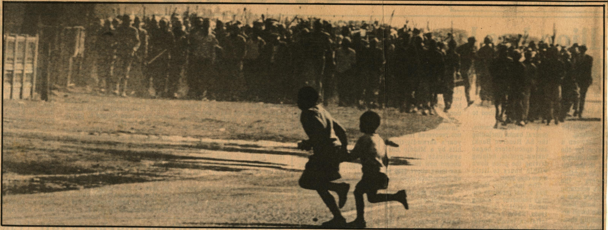
FLEEING from the violence: two children run for cover as a Zulu impi takes to the streets in Thokoza on the East Rand, during vicious clashes between the ANC and Inkatha.