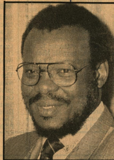
Inkatha president Dr Mangosuthu Buthelezi.