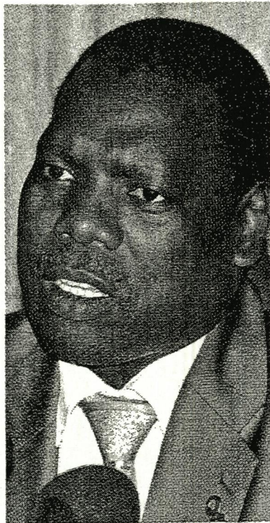
NO PLOT: Zweli Mkhize

The state alleges there was corruption, money laundering and tender fraud