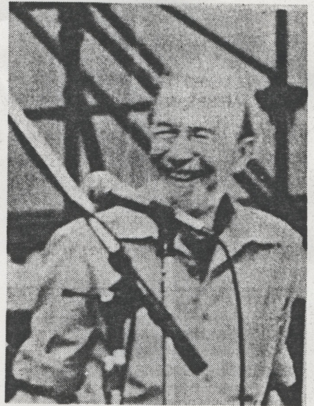
Pete Seeger on Building Bridges, May 18 at 7:30pm