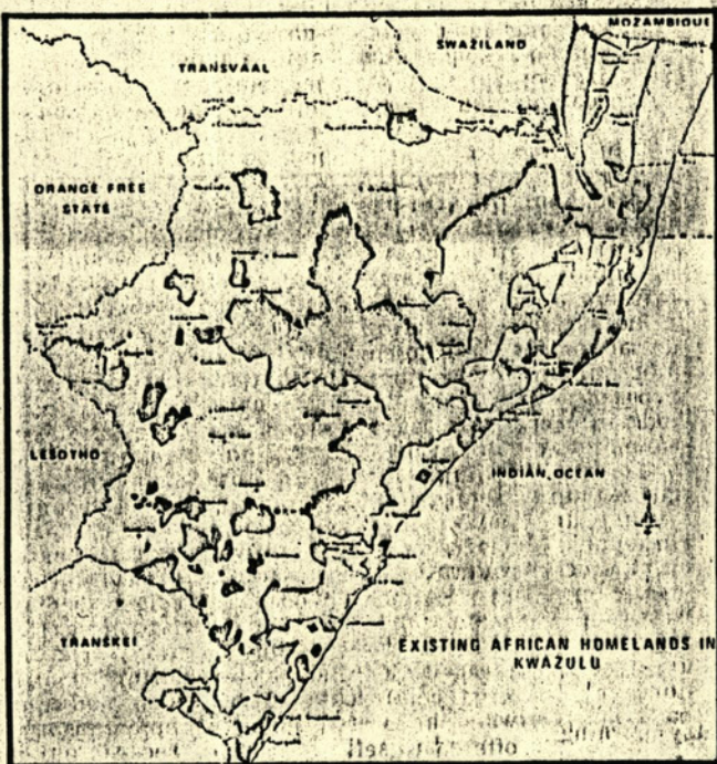
Map: Institute of Race Relations

Ironically, the "stubborn" white voters of the area have something to do with this: Their continued opposition to the National Party makes it at least feasible that they could support a political policy for the area that differs from the NP's policy of partition and "independence" for KwaZulu.