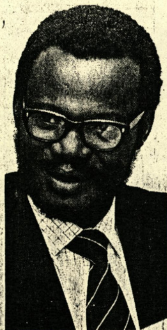
Chief Buthelezi... vital role as a moderate

The committee apparently issues a strong warning that a regional solution in the area cannot be seen as a substitute for central government representation and warns the government of extreme dangers of delaying constitutional reform.