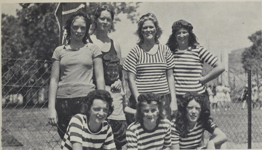
Connaught Cheer Leaders.