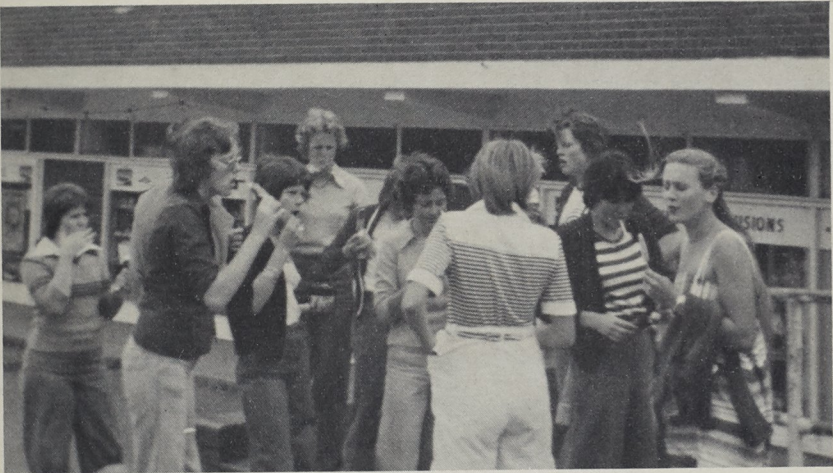
Std. 8b at Illovo Beach.

Sunday morning was our last chance to go to the beach and we all made the most of it. Departure time was not too popular, as all of us could have done with another week down there. Soon the dreaded thought of going back to school arrived. Back to work. Work did I say? The next couple of days consisted of the Std. 8b's describing the most successful week-end to all the girls left at school. This was a week-end truly to be remembered.