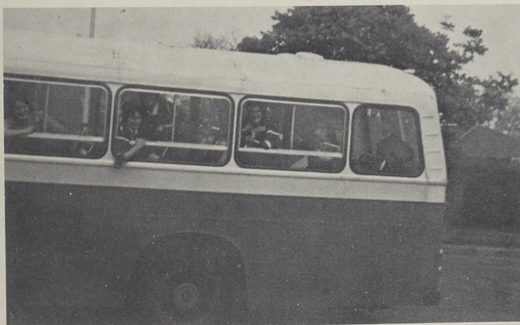
Std. 9's leaving on an ecology tour.