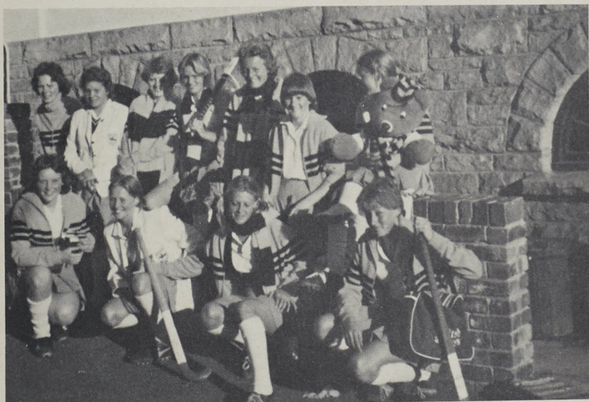
The Hockey Team on Tour.

Very early Wednesday morning we left the airport and arrived in Durban. After a very enjoyable and successful tour with six goals scored against us out of twenty six.