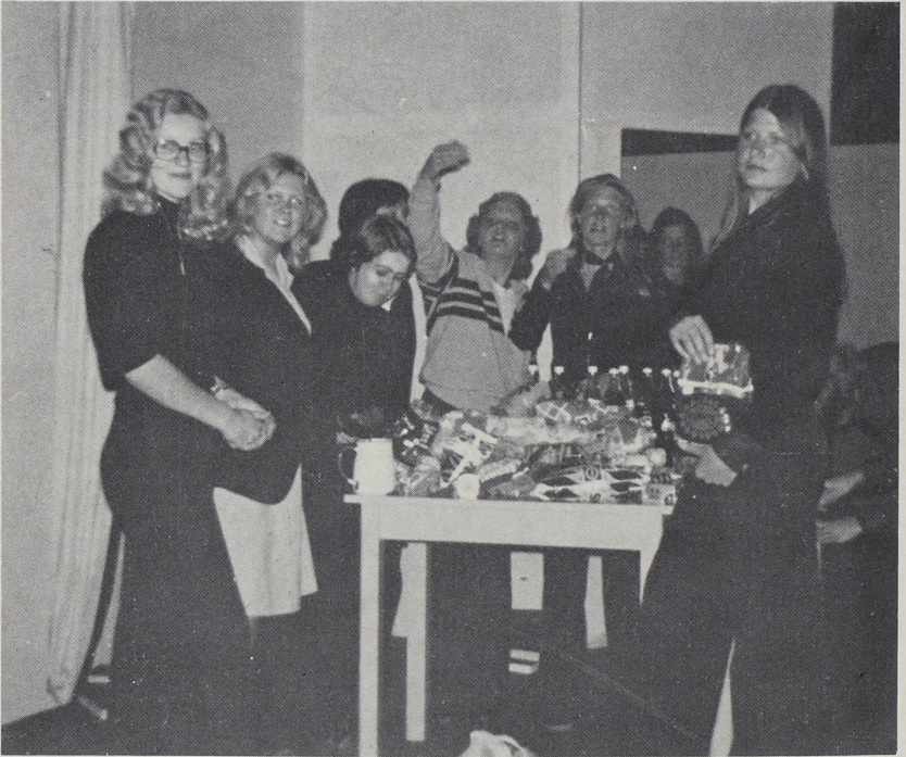
Backstage party of “One Way Pendulum”