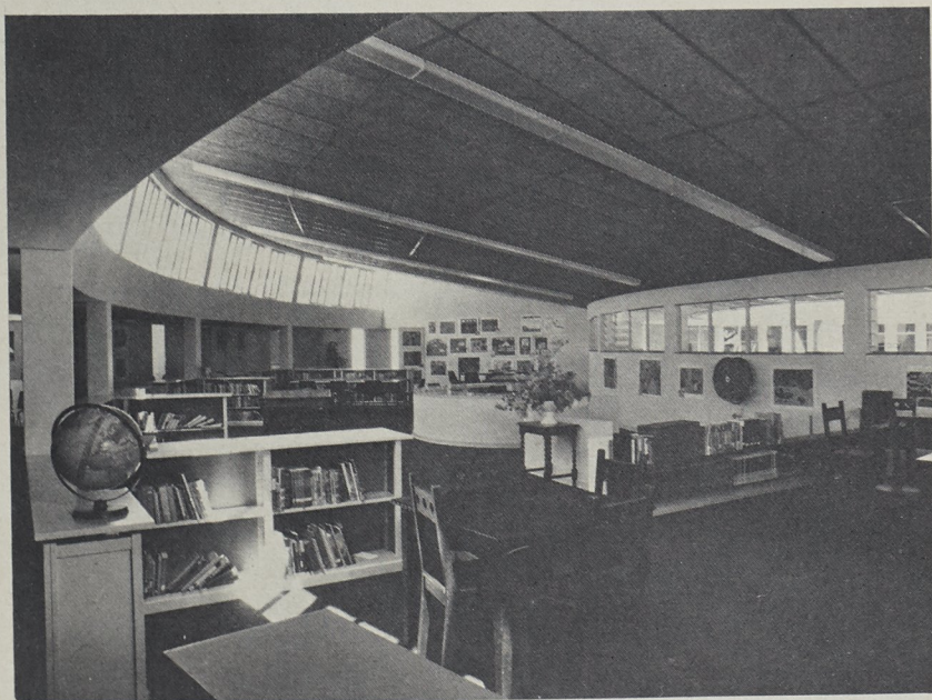
Inside the New Resource Centre.