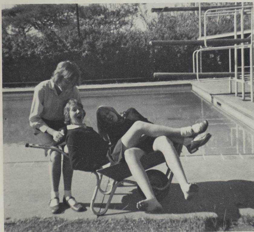
Weekend in B.E.