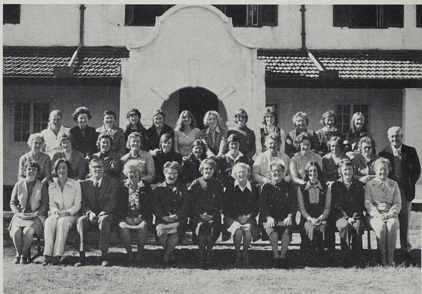
The Staff – 1976

Let me not to the marriage of true minds Admit impediments. Love is not love Which alters when it alteration finds, Or bends with the remover to remove:— O no! it is an ever-fixed mark That looks on tempests, and is never shaken; It is the star to every wandering bark, Whose worth's unknown, although his height be taken Love's not Time's fool, though rosy lips and cheeks Within his bending sickle's compass come; Love alters not with his brief hours and weeks. But bears it out ev'n to the edge of doom. If this be error, and upon me proved, I never writ, nor no man ever loved.