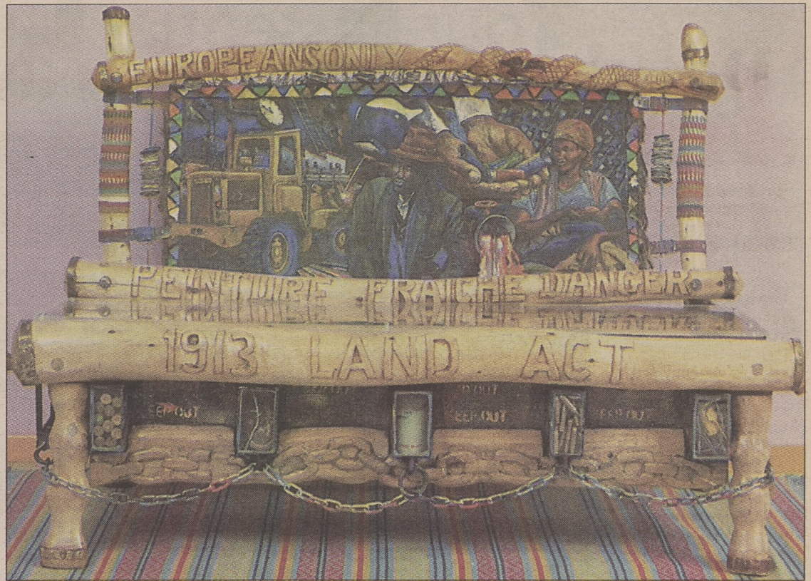
Mixed media and wood ... Willie Bester's "1913 Land Act".