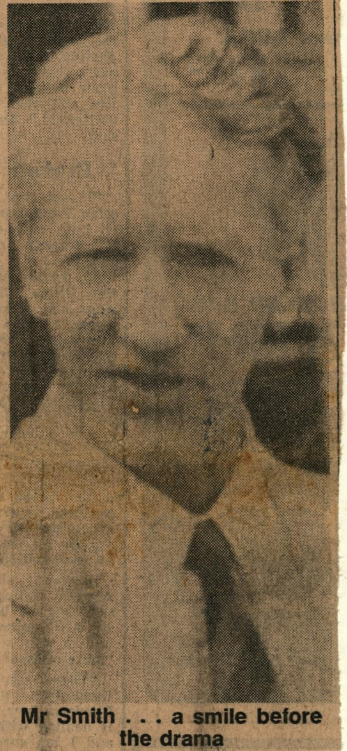
Mr Smith . . . a smile before the drama

• The Lusaka conference had indicated that the Black powers would consider suspending the principle of Nibmar — no independence before majority African rule — in exchange for a firm timetable of progression towards majority rule.