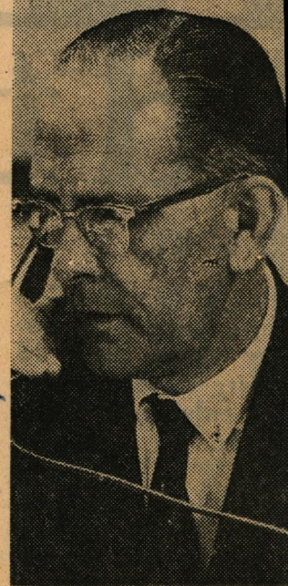
General Hendrik van den Bergh.

GENERAL Hendrik van den Bergh, the head of the Bureau for State Security (Boss), and his senior officers played a major role behind the scenes in master-minding and executing the plans which led to the dramatic breakthrough in South Africa's relations with Black Africa.