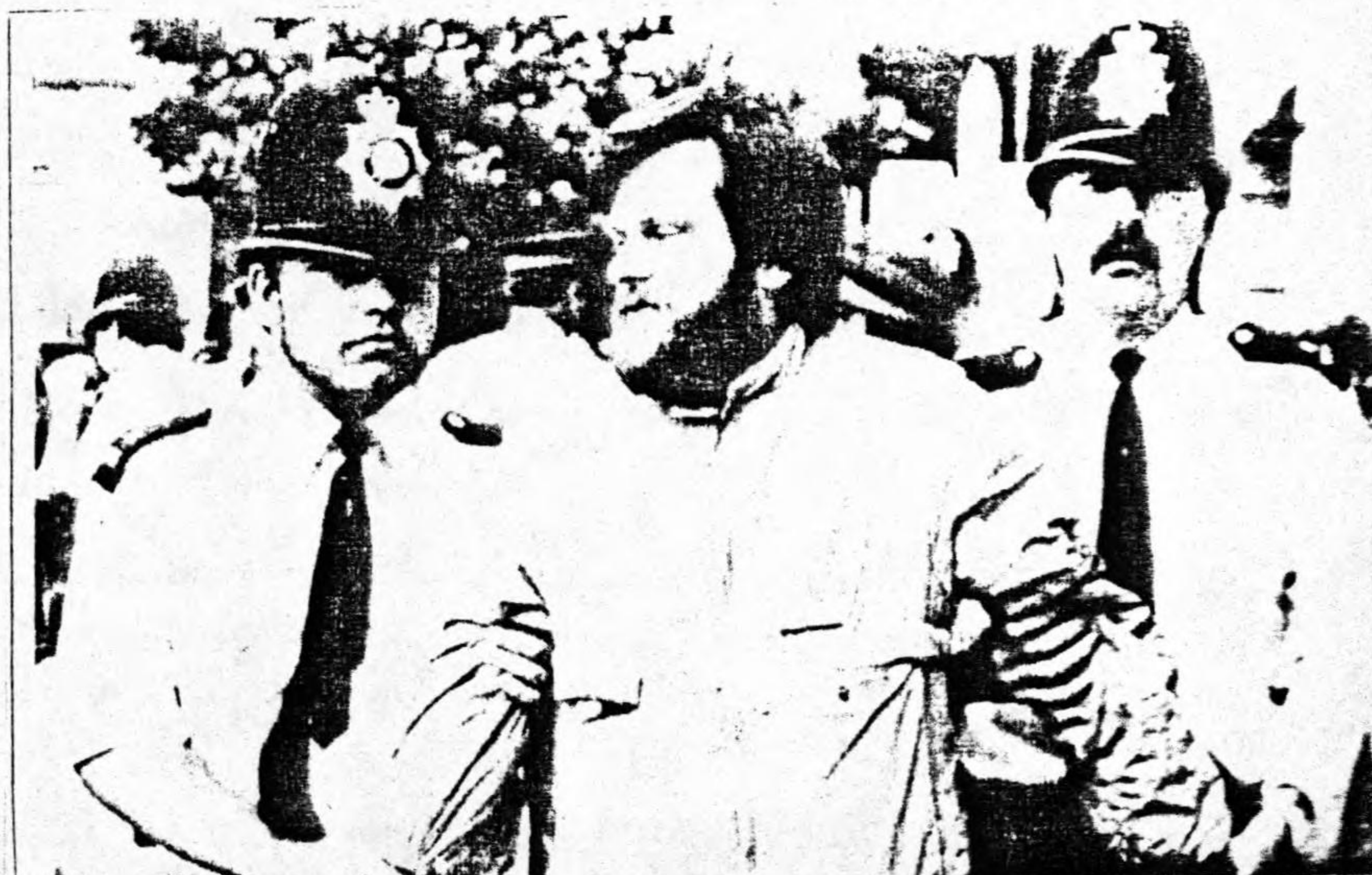
The South African embassy in London last night: police move in to arrest one of those who joined a mass picket protest against the apartheid regime's terror