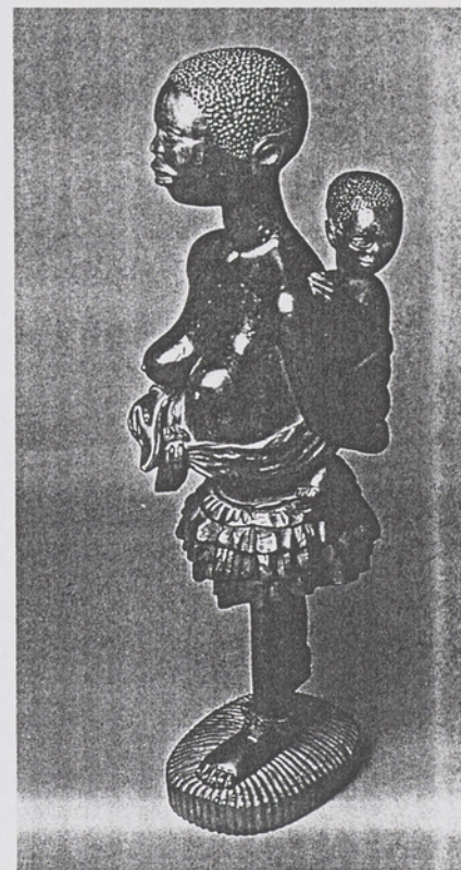
Cat. 113 Untitled 1960 Unidentified wood 54 x 15 x 16 Inscribed below base: April 1960 | S. Sedibane Collection: KC