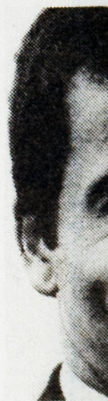
A 39. Plum played so rounder k ing leg-sp