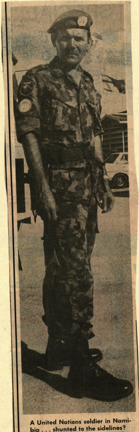
A United Nations soldier in Namibia . . . shunted to the sidelines?