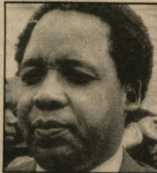
Chris Hani . . . says he opposed the use of force.

Hani admitted to visiting the notorious Quatro detention camp and interviewing some of the detainees for written reports to the leadership.