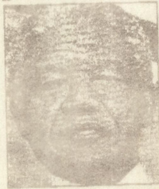
Nelson Mandela... concern about high unemployment.

Mandela told the newspaper he did not expect to serve in the interim government creat-