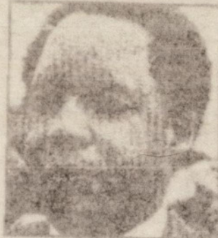
Chris Hani... says he asked for an end to execution of mutineers.

However, he denied any personal involvement or giving orders for anyone to be tortured or executed.