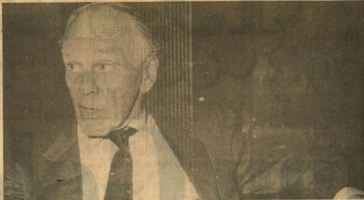
Lord Bill Deedes, former editor of London's Daily Telegraph... politicians should be nervous and journalists sceptical.

The British peer was recently in South Africa gathering information for newspaper articles he is to write. His visit coincided with the temporary closing of the