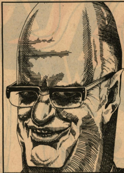
Mr P.W. Botha