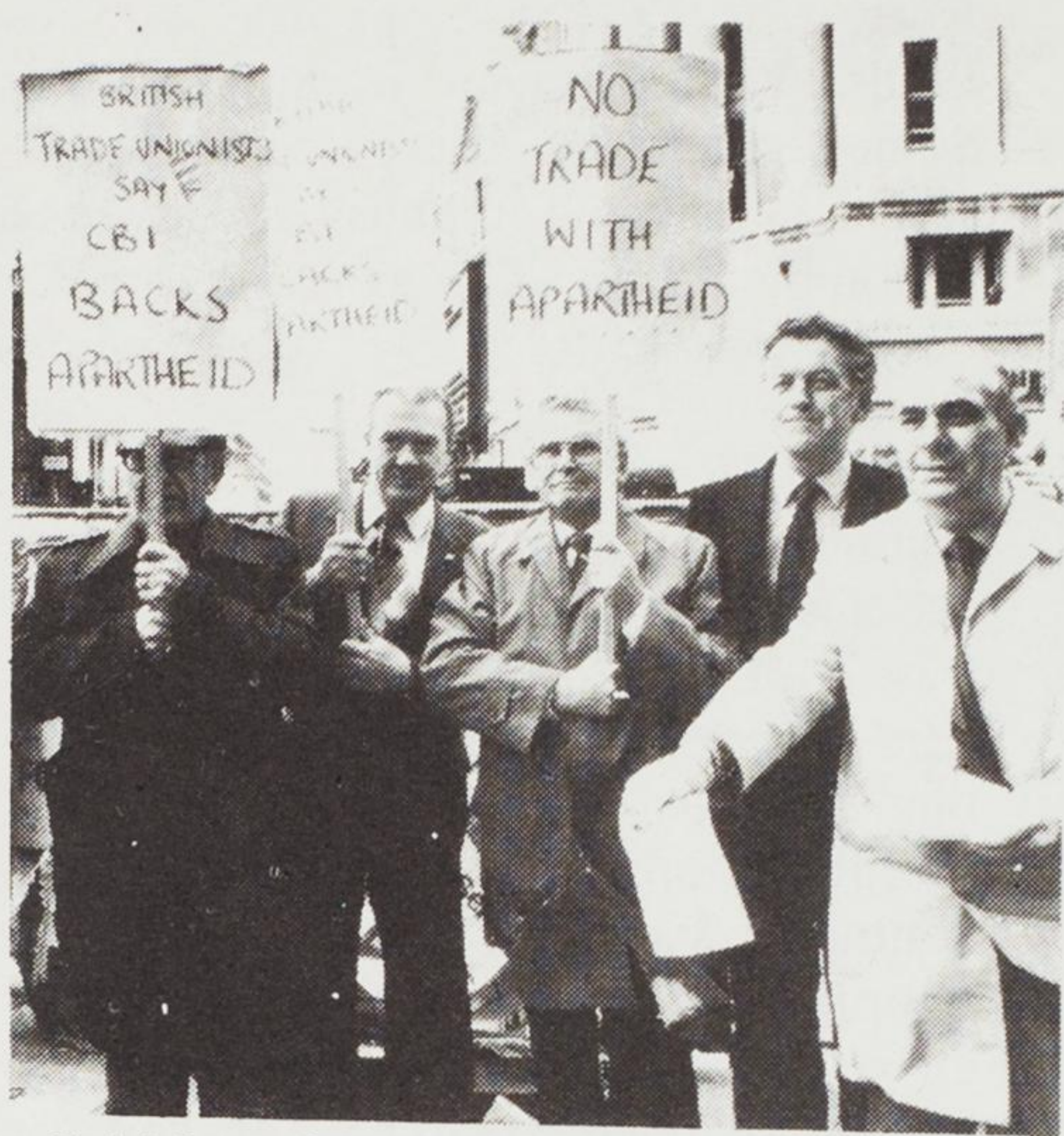
British trade unionists picket outside the CBI to demand an end to UK support for apartheid

Africa is an essential part of the process of national liberation. That is the key to the approach of the TUC and other national trade union organisations. For many years we have been giving — and intend to go on giving — not only moral support but practical assistance to trade unions in South Africa which represent black African working people. The decision our Congress reached — at a time when you, Mr Chairman, presided over our International Committee — has been shown to be correct and our policy of providing practical trade union assistance in South Africa has been fully vindicated. Black workers in South Africa have been forming and joining trade unions in increasing numbers ever since the Natal textile strikes in 1973, and the independent black trade union movement is now reliably estimated as being 300,000 strong. The process is still going on and it is irreversible.