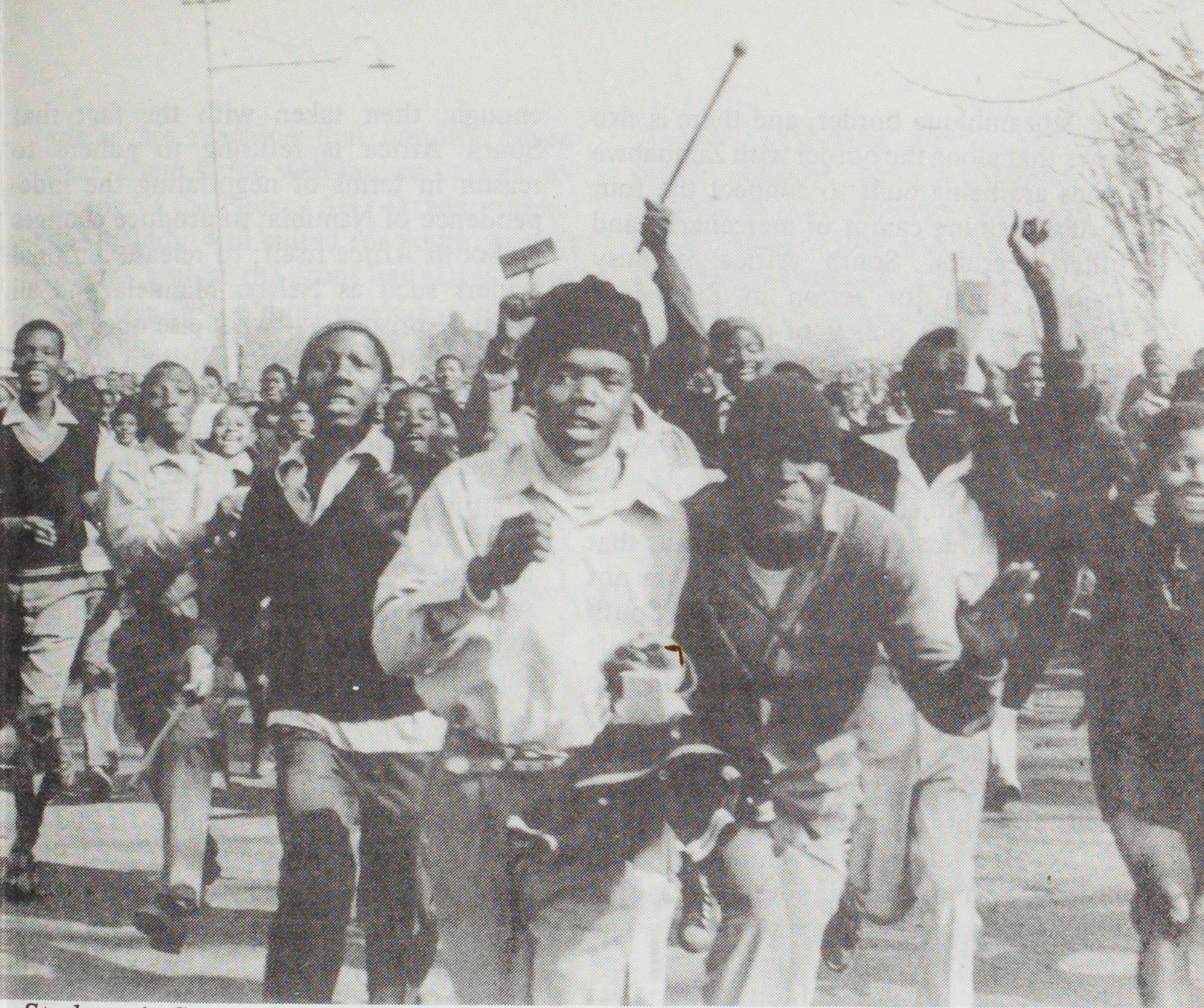
Students in Soweto demonstrate against apartheid

But today, in South Africa itself, there is a developing armed struggle and the majority people of that country are engaging in a courageous resistance which is nationwide and which we see symbolised by the action of trade unionists as well as students and other sections of the oppressed community. That resistance is increasing daily and the regime, which is getting desperate as a result of this resistance, is beginning to rely more and more on the exclusive use of force in order to keep itself in power.