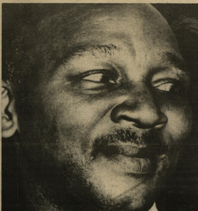
Many enemies ... Political opponents were not the only foes of Winnington Sabelo

appearance at the funeral of the cinema victims. Mourners were attacked, buses were stoned and the amabutho kicked over markers on the new graves.