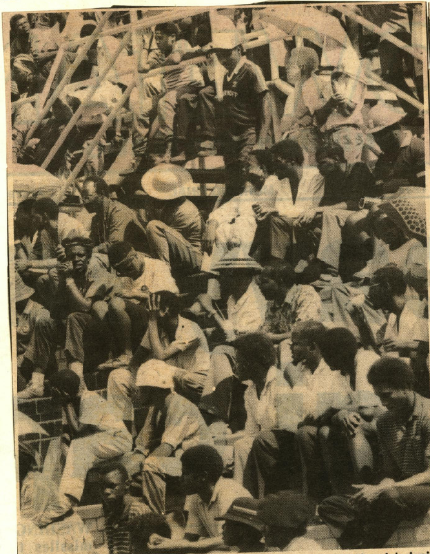
Some of the people who attended the ANC rally at the Jabulani Amphitheatre in Soweto yesterday.