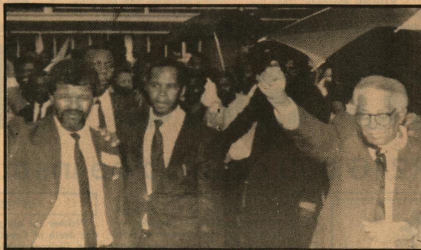
WALTER Sisulu (right) raises a clenched fist after meeting his son Max (left) shortly after the arrival of the ANC leaders in Lusaka.

During the familiarisation procedure, the media tactic was to latch on to a friendly ANC official — grab a terrorist, as some